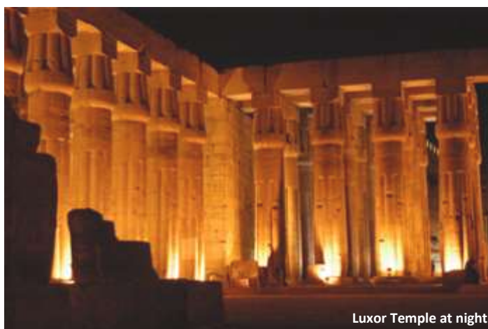
Luxor Temple at night

This afternoon, we board our Nile River cruise ship, which will be our home as we sail south, "up" the Nile to Aswan. (B, L, D)