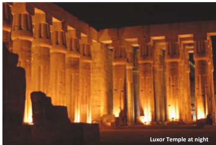
Luxor Temple at night

We will also visit the Temple of Luxor built by the new kingdom pharaohs Amenhotep iii (c. 1386-1349 B.C.) and Ramesses ii (c. 1303-1213) for the Theban triad. This afternoon, we board our Nile river cruise ship , which will be our home as we sail south, "up" the Nile to Aswan. (B, L, D)