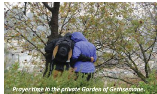
Prayer time in the private Garden of Gethsemane.

We begin our pilgrimage on the Mount of Olives , the " Palm Sunday Road ," at Dominus Flevit , where we look directly across to the Temple Mount with a breathtaking view of the Dome of the