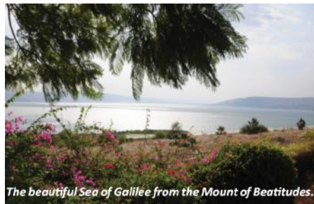
The beautiful Sea of Galilee from the Mount of Beatitudes.

We begin this very special day with Mass and a study session on the Mount of Beatitudes . Then, we descend the hill to Capernaum . Sitting under the trees, we share the story of Jesus driving out the demon from the man who attended his